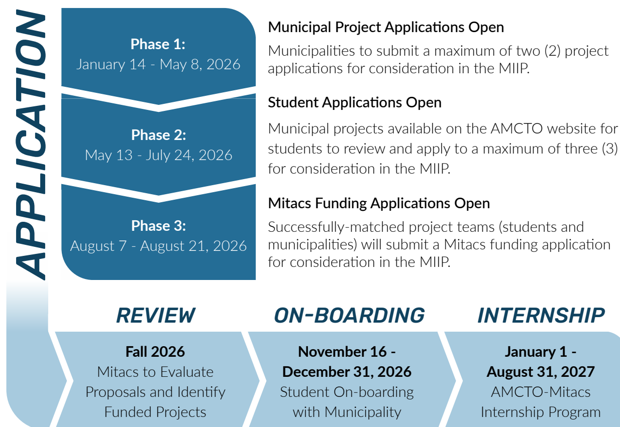
Figure 1: The AMCTO-Mitacs MIIP Process

The MIIP consists of three (3) application phases. The first phase is the Municipal Project Application(s), followed by the Student Application(s) phase, and the Mitacs Funding Application phase. The figure below illustrates the timing and sequencing of the MIIP: